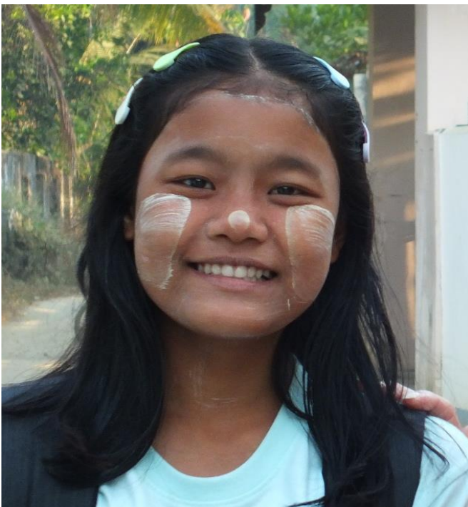
With Wine Pone Chit in February 2024 age 14

https://photos.app.goo.gl/d73Eq7ZogeJNeS4j9