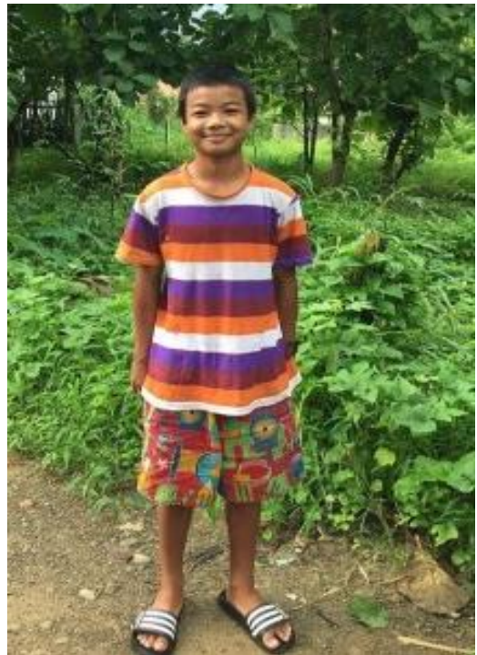
and in November 2019 aged 12